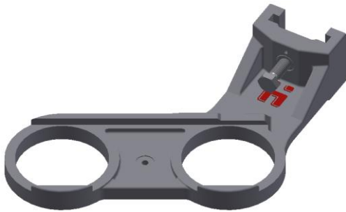
Funnel Holder QC