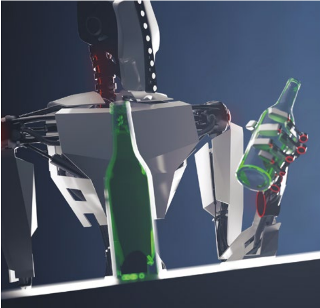
The Ranger 2 camera-based check inspection system works with software for image processing to make a decision; 'container okay' or 'not okay'.