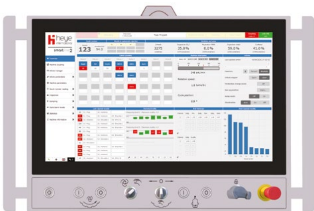
The graphic user interface of SmartLine 2 was designed for practicality and ease of operation.

Feedback generated from Heye International customers has confirmed the SmartLine equipment's robustness and reliability. The mechanical design and drive system in particular are highlighted for their robust design, while the control system is praised for its reliable operation. ●